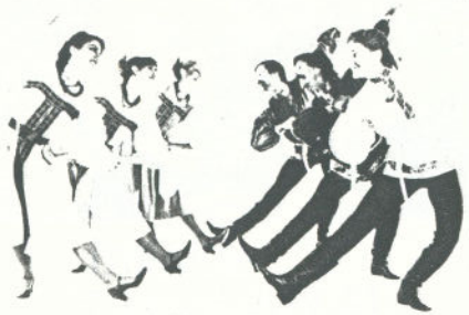
KHADRA International Folk Ballet San Francisco Touring Production