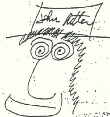
John Ritter