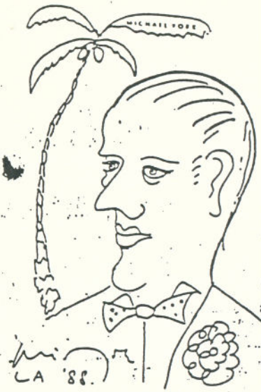
Michael York by Michael York

Admission to the auction, which is being held at a private home in Encino, is $35. The silent auction starts at 3 p.m. on Saturday; the formal auction begins at 4:15 p.m. For information, call (818) 780-2240.