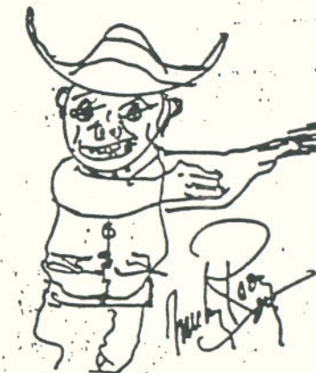
Mickey Rooney by Mickey Rooney