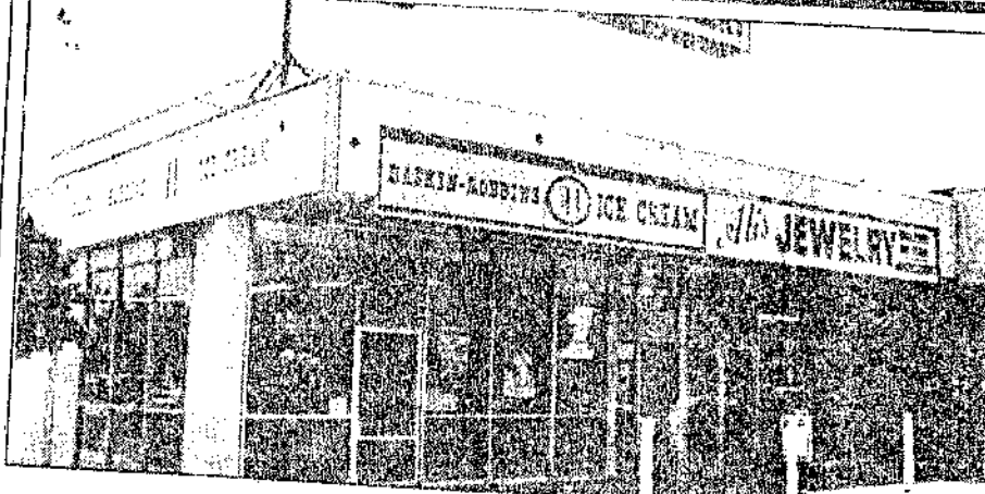
Readers prefer ice cream from Baskin-Robbins 31 Ice Cream stores like this one in Van Nuys.